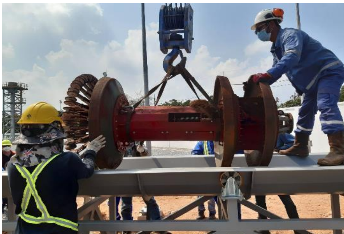
36" x 55 km. Caliper Survey with 3D Mapping